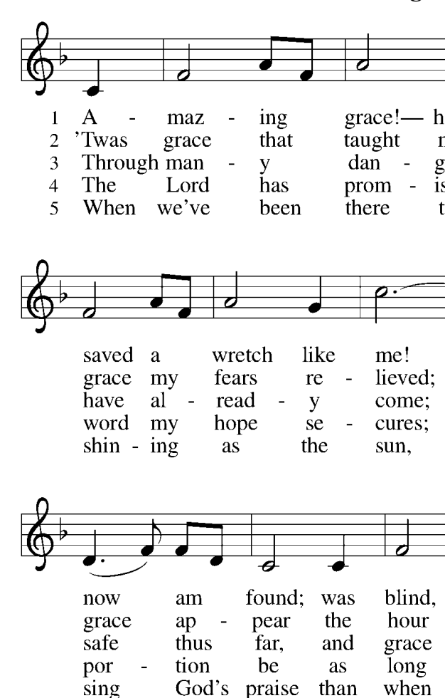
Text: John Newton, 1725–1807, alt., sts. 1–4; anonymous, st. 5 Music: NEW BRITAIN, W. Walker, Southern Harmony , 1835